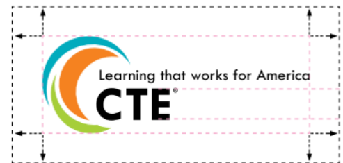
Figure 21. The minimum distance that should be allowed between the CTE logo/signature and other elements, such as a headline or text, is one brand letter height.