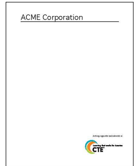
Figure 5. Sample letterhead showing relationship between corporate logo and CTE brand.